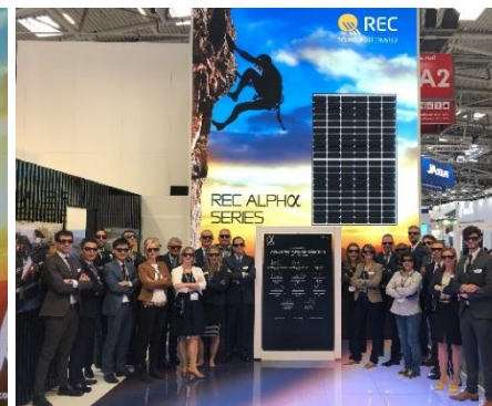
REC Team celebrating the successful launch of the REC Alpha Series at Intersolar Europe 2019

The Intersolar Award is presented to companies making a substantial contribution to the success of the solar industry, honoring technological innovations and groundbreaking solutions. An independent jury of industry experts assesses the leading panels on the basis of innovation, technological creativity and benefits, environmental impact and pricing. REC panels are repeatedly recognized as cutting edge products in the industry: the Intersolar Awards, along with being a Top Performer in the annual DNV-GL PV Module Reliability Scorecard for five years in a row now, clearly demonstrate that REC Group is pushing the solar industry forward through its dedication to innovation and first-class quality.