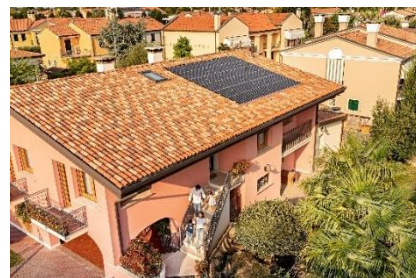
First REC Alpha panels rolling off the lines at REC Group's manufacturing site in Singapore; the world's first REC Alpha installation empowering homeowners