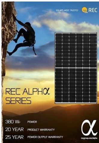
REC Alpha Series reaching 380Wp (60-cell version), and 450Wp (72-cell version)