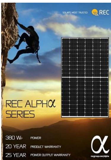
REC Alpha Series – the world's highest power 60-cell solar panel

The ALJ's order marks an important day not only for REC Group , but the entire solar industry. The ALJ's order comes as no surprise to REC Group, nor to its trusted and longstanding partners and customers. The order is a testament to REC's confidence since the beginning that Hanwha Q Cells' claims against the Norwegian headquartered brand are and have always been without merit. REC Group is pleased with the ALJ's order and is looking forward to further defending its position on non-infringement before the full Commission.