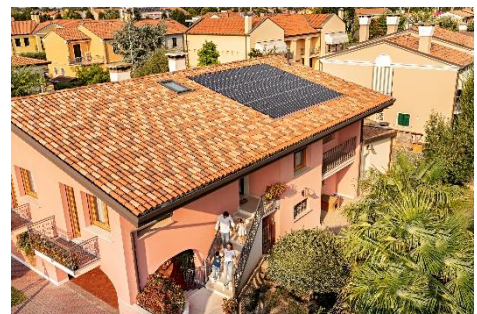
First REC Alpha panels rolling off the lines at REC Group's manufacturing site in Singapore; the world's first REC Alpha installation empowering homeowners

With this decision, REC will continue to strongly focus on its overall mission: to empower homeowners, businesses, and communities around the world with clean and affordable solar energy. REC Group is confident that this can best happen with pioneering technology. Most recently, REC started production of the world's highest power 60-cell panel, the REC Alpha Series , at an annual capacity of 600 MW. With this expansion and investment in pioneering solar technology, REC's Singapore facility is now one of the largest and most advanced solar PV manufacturing operations, exceeding the production scale of any solar manufacturing facility in the U.S. or Europe. And the company aims to further grow by another 2 to 3 GW . Based on its revolutionary heterojunction technology and a patented panel design, the new REC Alpha Series will set a higher standard for the global energy market; helping to push solar energy over the tipping point as a crucial energy source to combat climate change.