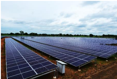
Kasim Textile Mill solar installation

REC Group has supplied 11.5 MW in solar modules to Kasim Textile Mills and Eveready Spinning Mills from Tamil Nadu. These shipments come on top to the 20 MW that have been supplied to textile industry in Q3 last year already.